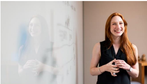
Why knowing how your adult education organisation performs in CPD matters