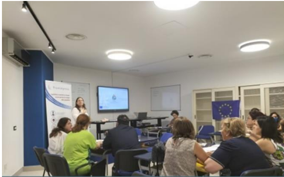
Pilot testing and multiplier events in Italy!