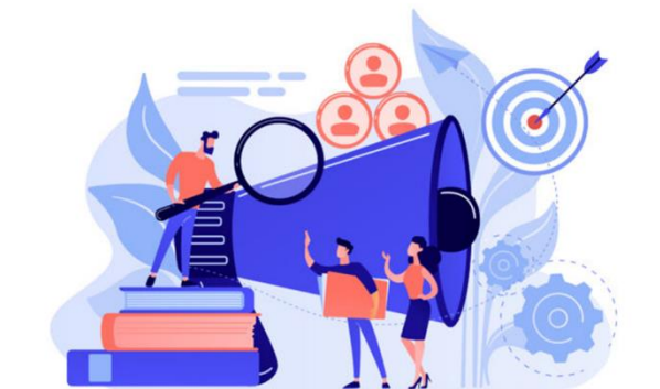
Focus groups in IPAL research