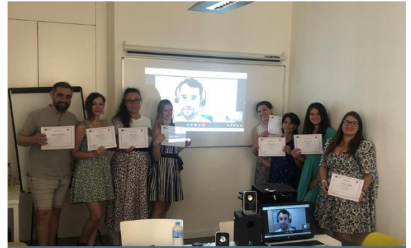
The IPAL meeting in Malaga